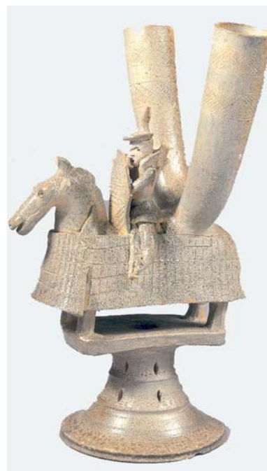
1.3. 4-5 th century Kaya Clay Armored Cavalry Soldier with Horn Chalice, Deok-san-ri, Kim-hae, Korea