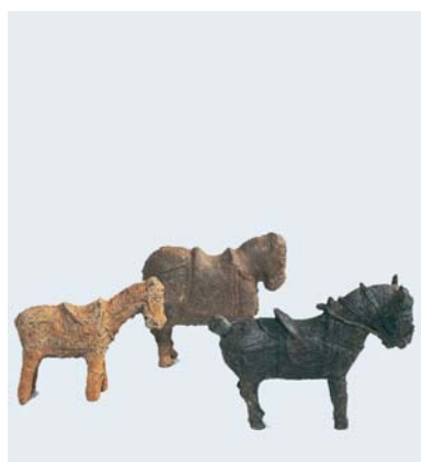
1.5. Koguryeo Clay Horses Cheol-ryeong, Korean Peninsula

5 Another drought period of maximum intensity occurred around 800 CE. See Lamb (1995: 157, 159, 168). The decline and fall of the Tang dynasty in mainland China, the Silla dynasty in the Korean peninsula, and the Yamato Court in the Japanese islands all began sometime around 800 CE. By the late tenth century, however, strong new dynasties began to emerge and consolidate all over these regions.