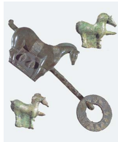
1.8. Horse-shaped Bronze Buckles excavated at the Cheon-an and Yungcheon area, Korean Peninsula.