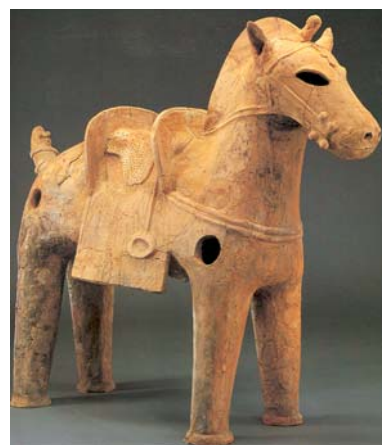
1.4. Haniwa Clay Horse, Late Tomb Period, Japanese Islands