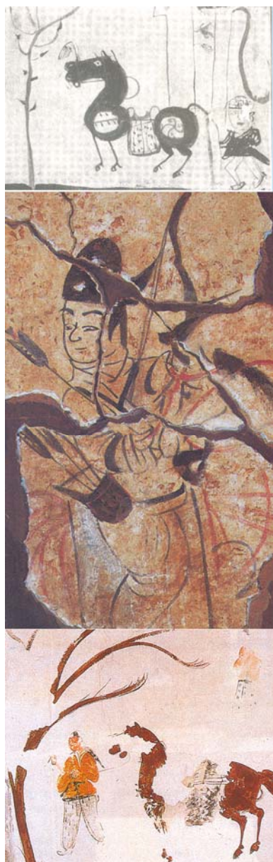
1.7. (Top) Xinjiang Uighur Zizhigu, Urumqi, 4-5 th century Tomb Painting; (Middle) Xianbei Former Yan Tomb, Chao-yang, Daling River Basin; and (Bottom) Koguryeo, Ko-san-dong Tomb, 4-5 th century, Pyung-yang

obvious. Stronger, however, the Koreans suffered wholesale destruction until they, voluntarily or involuntarily, changed their stance. A Manchurian force could not leave standing the threat to their rear posed by the Koreans before proceeding with their campaign against mainland China. The Koreans had to be either neutralized or subdued.