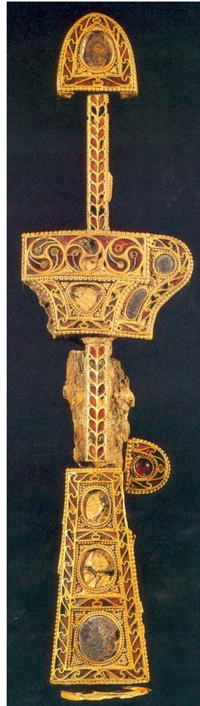
1.6. Sword excavated from the tomb of Silla King Mi-chu (r. 261-84)

When the rulers of Koryeo (918-1392) and Chosun (1392-1910) in the Korean Peninsula maintained the strategy of "Yielding to the Stronger," be it the Qidans, the Ruzhens, the Mongols or the Han Chinese, the Korean dynasty could maintain its independent nationhood free from the ravages of warfare. When the rulers of the Korean peninsula prematurely relinquished their neutral stance or stood up against the