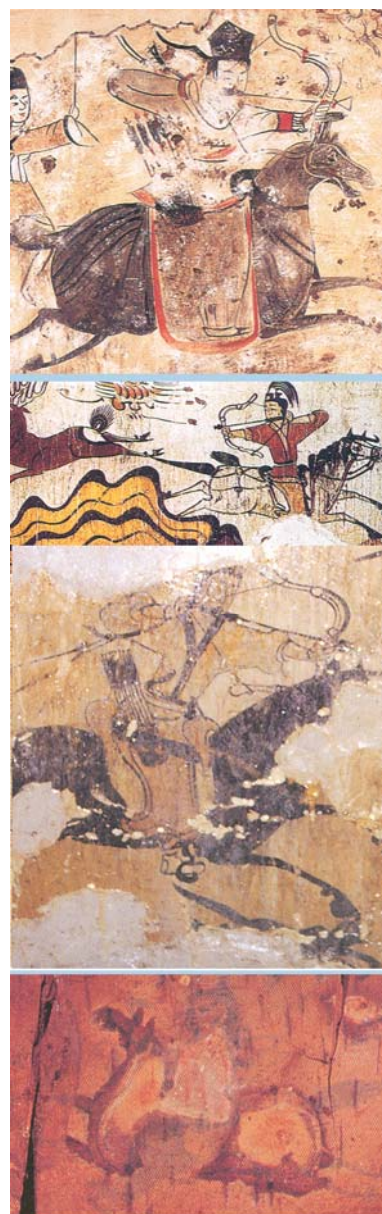
1.2. (Top) 4 th century Former Yan Tomb, Chao-yang, Daling River Basin; (Middle) Koguryeo, Tomb of Dancing, 4-5 th century, Jian, Jilin; and (Bottom) Silla, Cheon-ma-chong, 5-6 th century, Kyung-ju

After giving a brief description of the Sima Qian's bipolar world of the Xiong-nu Turks in the Mongolian steppe versus the Han Chinese below the Great Wall, Chapter 3 describes the rise of the Xianbei people of the western Manchurian steppe, the trial performance of a proto-conquest Murong-Xianbei dynasty in the name of the Former Yan that had innovated the "dual system," and the advent of the Tuoba-Xianbei who were able to occupy North China without conquering the Tungusic people in the central and eastern Manchuria. The performance of Xianbei Yan gave a preview of the full-fledged conquest dynasty to be followed shortly thereafter. The Ye-mack Tungus Koguryeo (37 BCE- 668 CE) of central Manchuria became a proto-Macro-Tungusic state after 400 CE by co-opting the Mohe-Ruzhen Tungus of eastern Manchuria, and coexisted with the Tuoba-Xianbei conquest dynasty (386-534) of western Manchurian provenance in North China. I focus on the Xianbei people of western Manchuria and their interactions with the Xiong-nu Turks in the Mongolian steppe, the Han Chinese below the Great Wall, and the Tungusic people in central and eastern Manchuria.